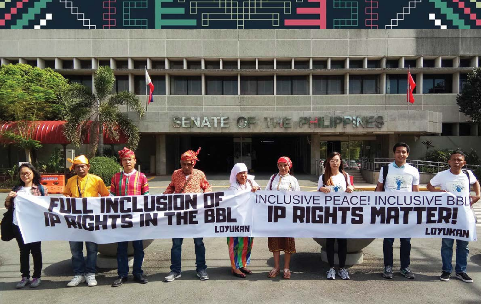
INDIGENOUS LEADERS AND IP RIGHTS ADVOCATES UNFURL BANNERS CALLING FOR FULL INCLUSION OF IP RIGHTS IN THE BANGSAMORO BASIC LAW AT THE SENATE MAY 2018

Bangsamoro Organic law and the meaningful implementation of these rights. Central to this is the recognition of the non-Moro Indigenous People's ancestral domain.