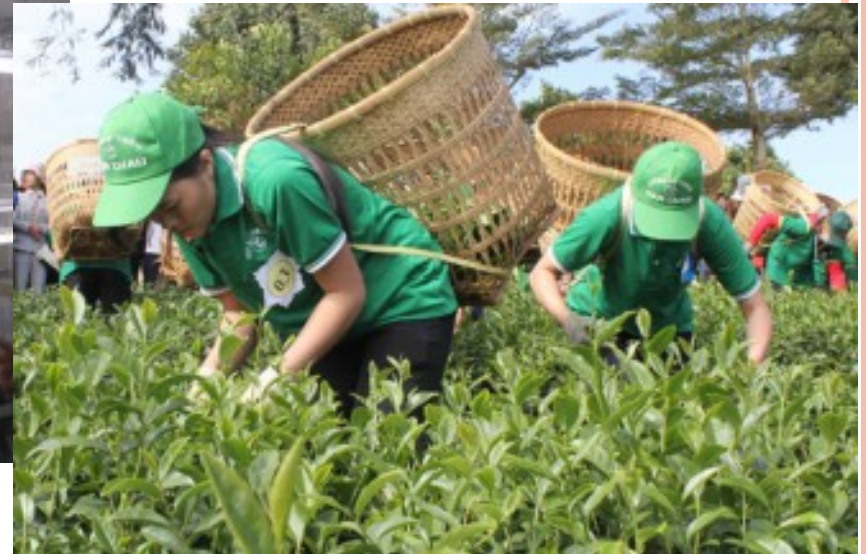
Unilever's contract tea production project in Vietnam started in 2013 to increase Unilever's procurement of high quality tea under sustainability program in 6 provinces of Vietnam.