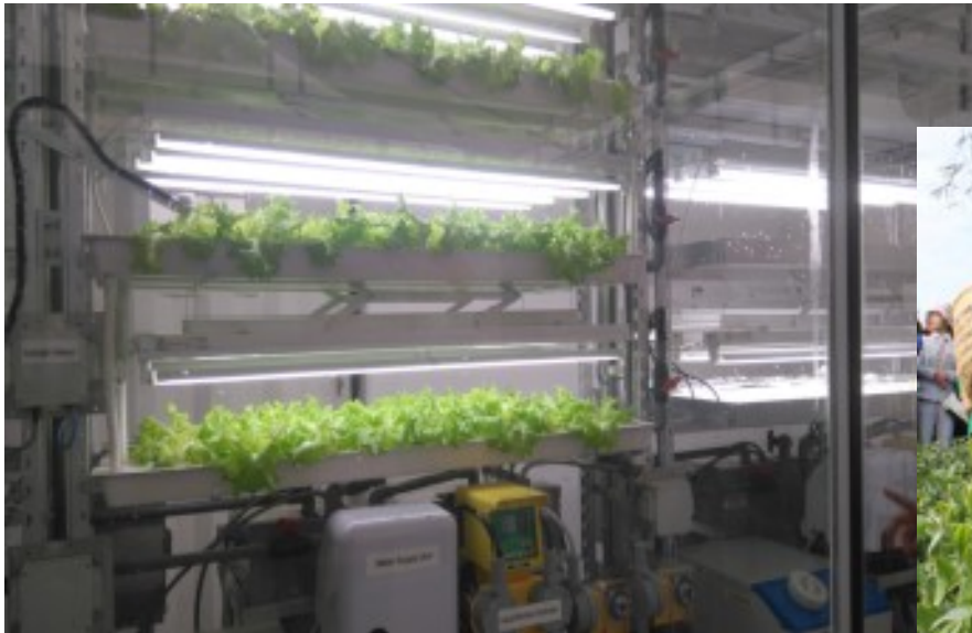
Fujitsu vegetable factory in Vietnam. Using high-technology to enable remote control of farm. (GRAIN, July 2016)