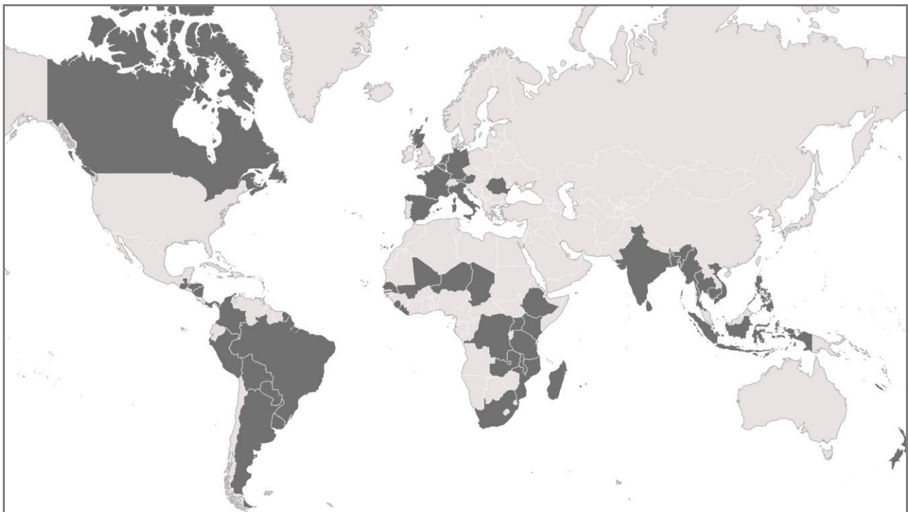
Map: Geographical coverage of the submissions (countries where activities have been carried out) 10

More than half of the submissions (40 out of 68) denounced that some groups or individuals have suffered harassment, persecution or detention due to their activities in defense of tenure rights in the last four years.