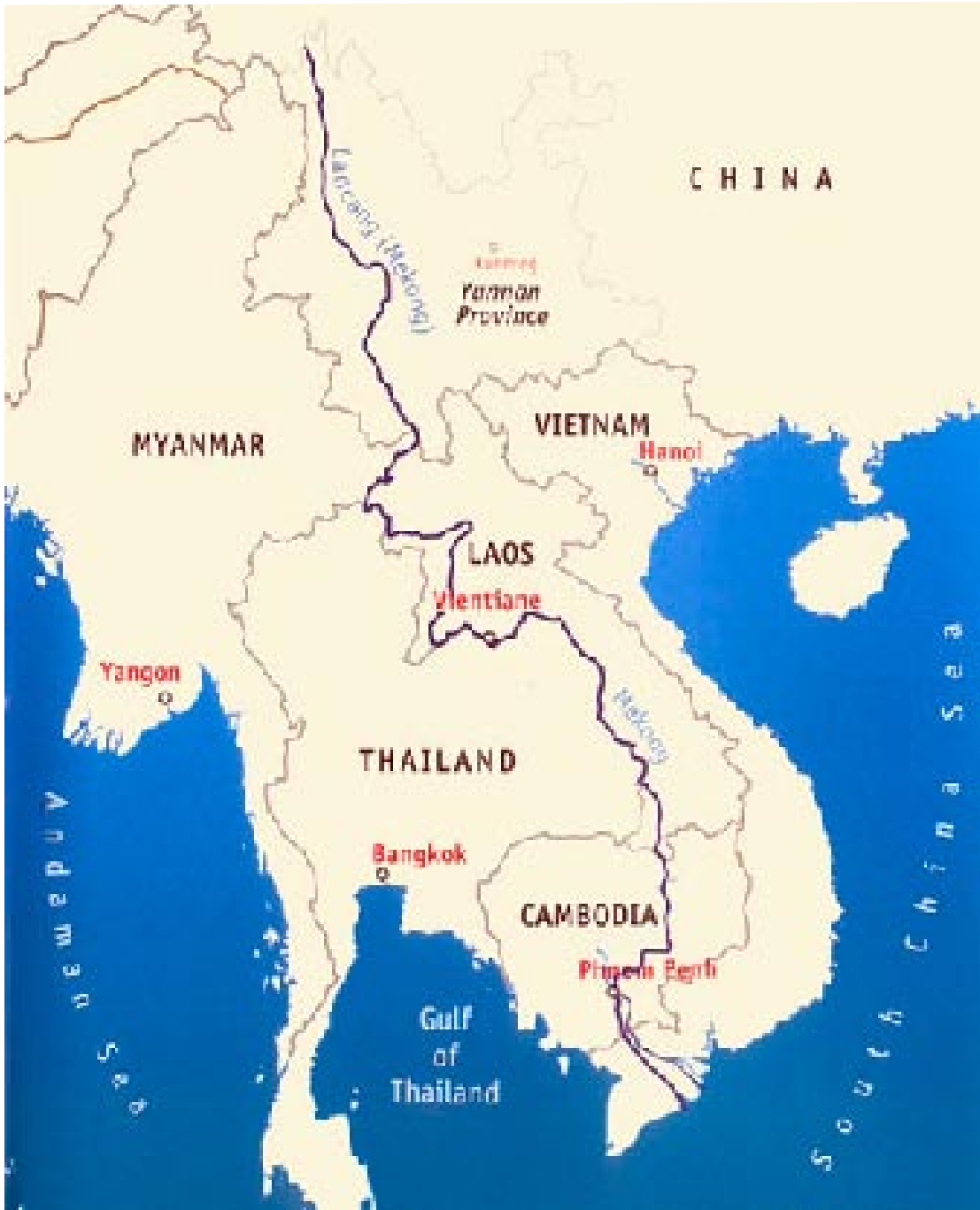
Figure 1: A map of the Mekong Region