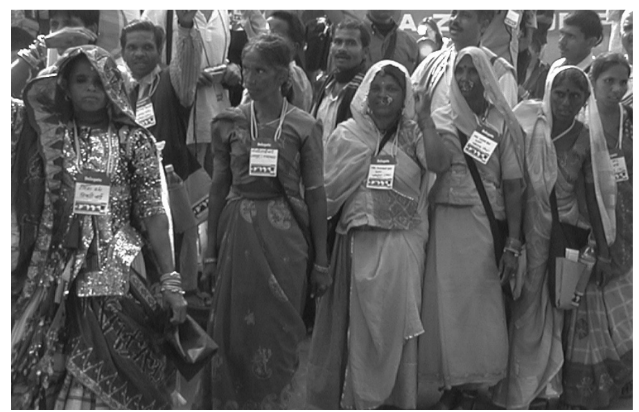
Women delegates at the World Social Forum, Mumbai 2004

peoples' movements, mass organisations and other civil society organisations for the first time in several years to share strategies for building alternatives to corporate led globalisation, neoliberalism, militarisation and religious sectarianism.