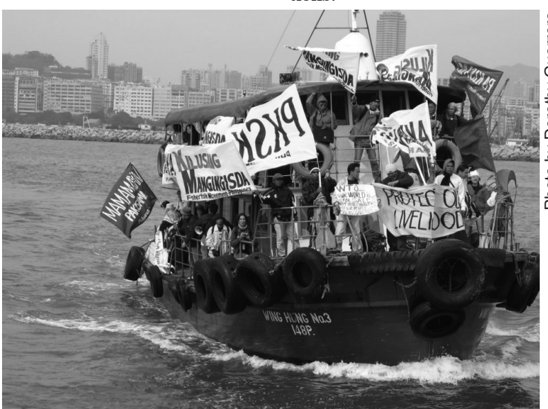
The Philippine fisherfolk movement, Kilusang Mangingisda, Launched a "Fluvial Parade' on the Hong Kong Harbour during the WTO Ministerial

Focus also produced a handy booklet called "The Derailer's Guide to the WTO" which was widely used in the run up to Hong Kong. It not only detailed in simple language the current agreements and issues at stake but it also gave ideas on strategies and possible actions.