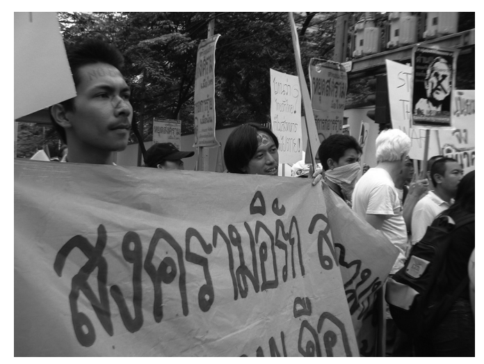
Buddhists and Muslims joined to protest the war on Iraq. 15th February 2003, Bangkok, Thailand

has successfully pursued through various projects. It was also a decisive step in initiating links with movements working for peace, democracy, and justice in the Middle East. With the Middle East seen as the target of US intervention for years to come, the Beirut Conference is just the beginning of deeper relations with the movements in the region.