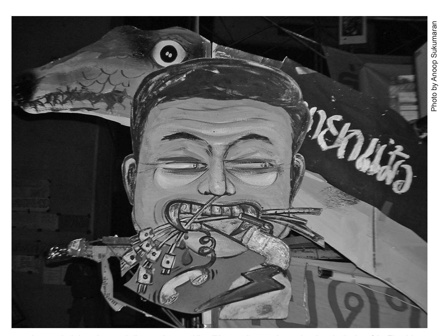
A poster depicting private capitalists gorging on public utilities at a demostration against the privatisation of the Electricity Generating Authority of Thailand (EGAT), March 2004

Focus remains committed to producing high quality, timely and progressive research and policy analysis on key issues. This work will be integrated into our five programme areas as far as possible however it is expected that from time to time we will need additional research and policy analysis capacity in which case we will engage contract researchers and/or re-deploy capacities within our existing resources.