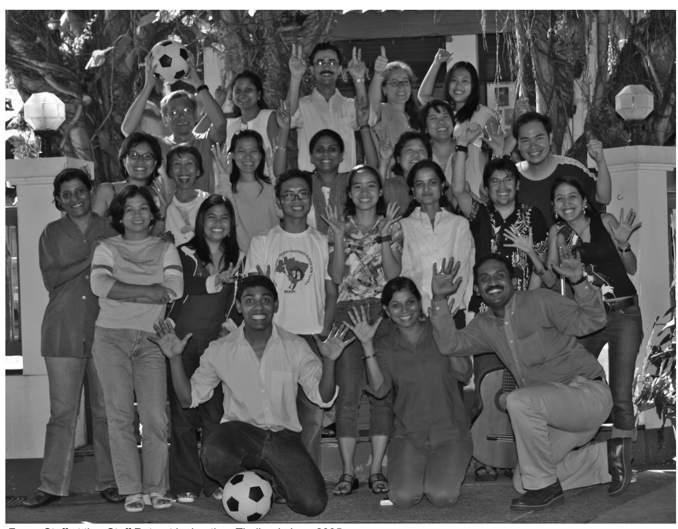
Focus Staff at the Staff Retreat in Jomtien, Thailand, June 2005