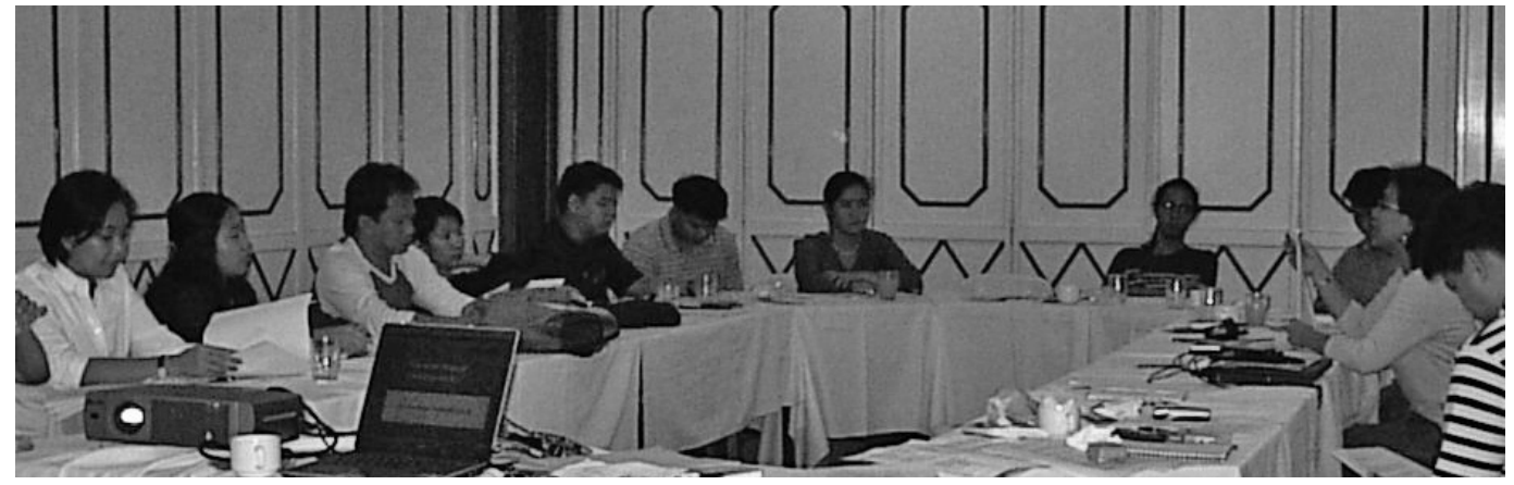
DRTS Water working group expansion workshop, June 2005

Peasant Institute and Philippine Network of Rural Development Institutes on understanding the essence of de Soto's model of development and its implications on government policies and programs, in particular land reform; SNR! presentation on the WTO and trade at the Indigenous Peoples Forum in Siargao Island, Mindanao; SNR! internal forum on GATS