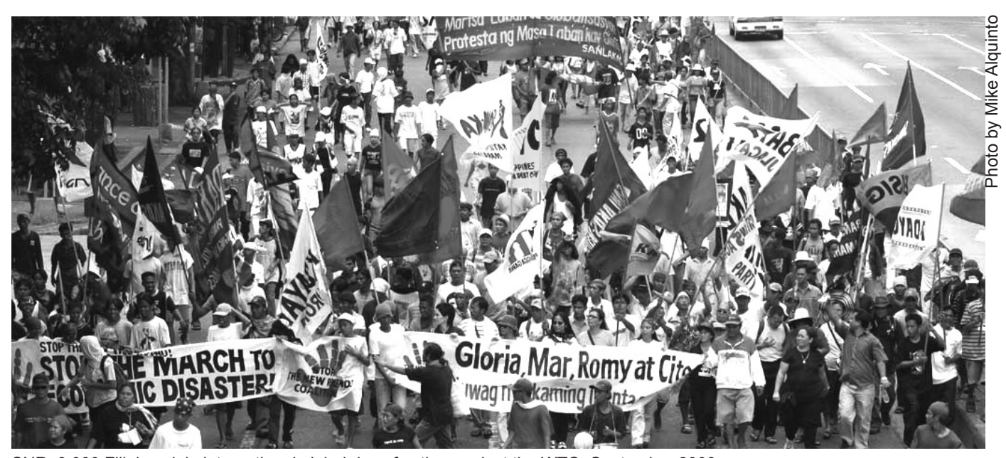
SNR, 8,000 Filipinos join international global day of action against the WTO. September 2003

Through the Land Research Action Network Project, Focus has been working with local and national agrarian