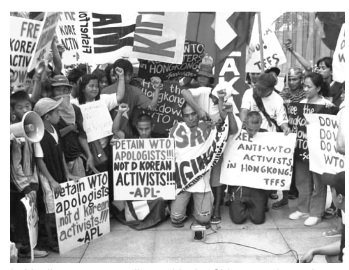
In Manila, protestors rally outside the Chinese embassy in support of the Koreans detained in Hong Kong