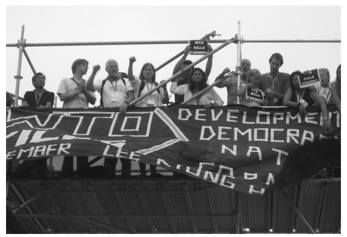
Civil society activists, victorious in Cancun, 2003

In the Philippines, Focus played a key role in the establishment of a national coalition called Stop the New Round!! Coalition (SNR) and served as secretariat. SNR brought together a broad and diverse range of groups, movements, unions and trade analysts who have not previously worked together on trade issues. It ran a full