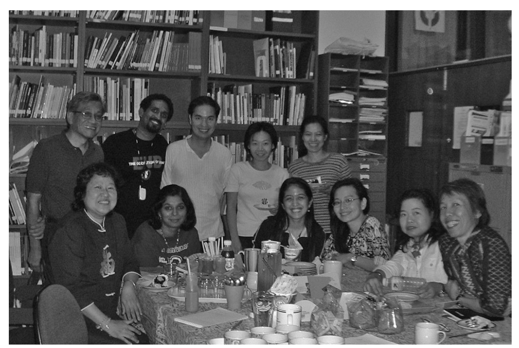
Some Focus Staff members at the office in Bangkok

Crisis Management Initiatives, DTP, e4Globe, Friedrich Ebert Stiftung -Thailand, Jubilee South, MSF-Belgium, RBF and University of Warwick