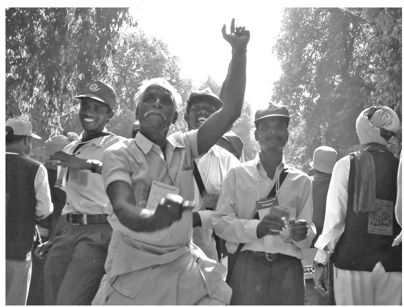
Dancing participant at WSF, Mumbai, India, 2004

These materials were translated into Hindi and were used as popular literature for mobilising farmers and activists against the privatisation processes. Similarly in the Philippines, Focus conducted seminars and workshop sessions on such diverse issues as water privatisation, the Hernando de Soto model of development, IFIs in transition countries, etc.