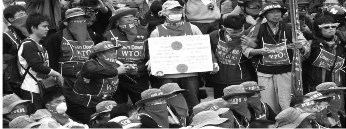
Korean farmers and supporters stage a sit-in during the Hong Kong ministerial