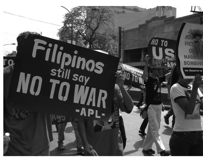
Anti-war demonstration in Manila, Philippines

Another important event in which Focus played a key role was the International Conference of Anti-War and Anti-Globalisation Movements held in Beirut, Lebanon in September 2004. The conference proved to be a milestone in building better links between the peace and global justice movements – an objective which Focus